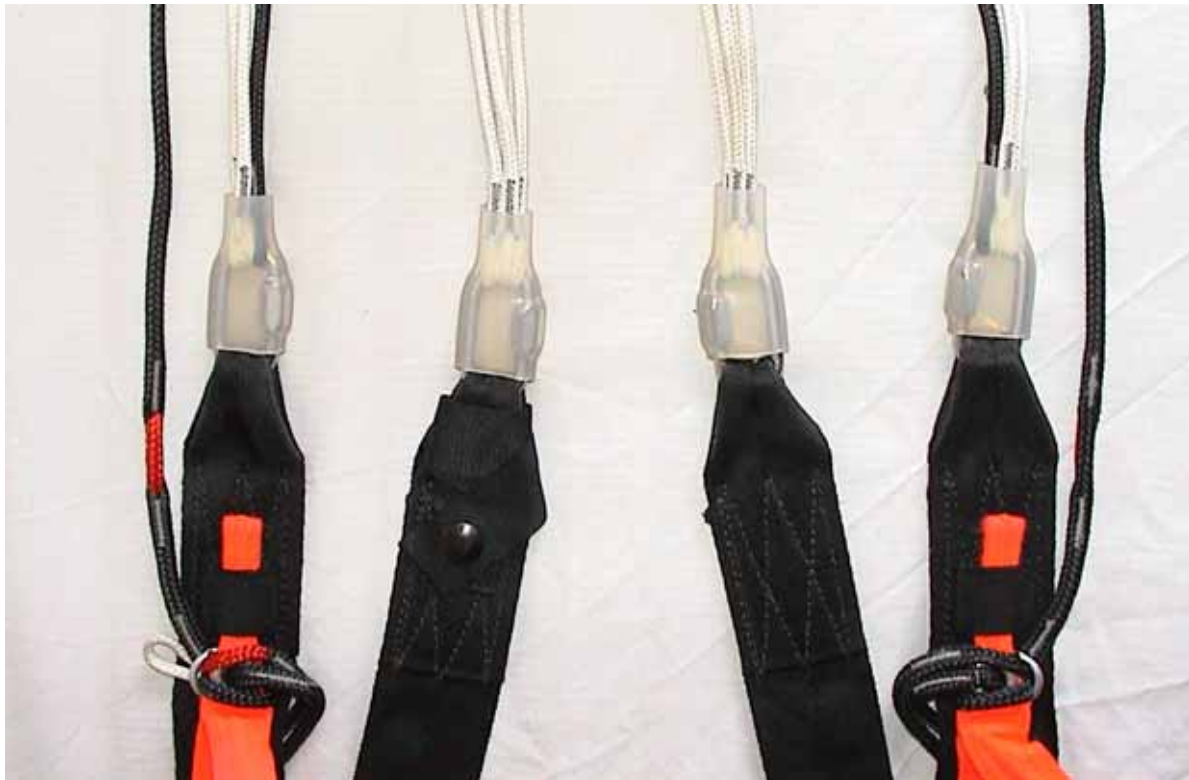
Left Rear Left Front Right Front Right Rear

Remember that each connector link has to show continuity from the lines to the canopy. Check each one for proper assembly.