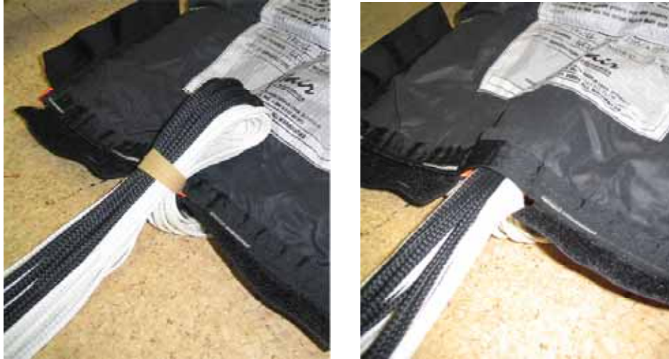
Figure 6a & 6b: Primary Stow

The center cell is underneath and will be accounted for when placing the canopy in the container. Lightly tuck these cells under the pack job, your canopy should now resemble Figure 5.