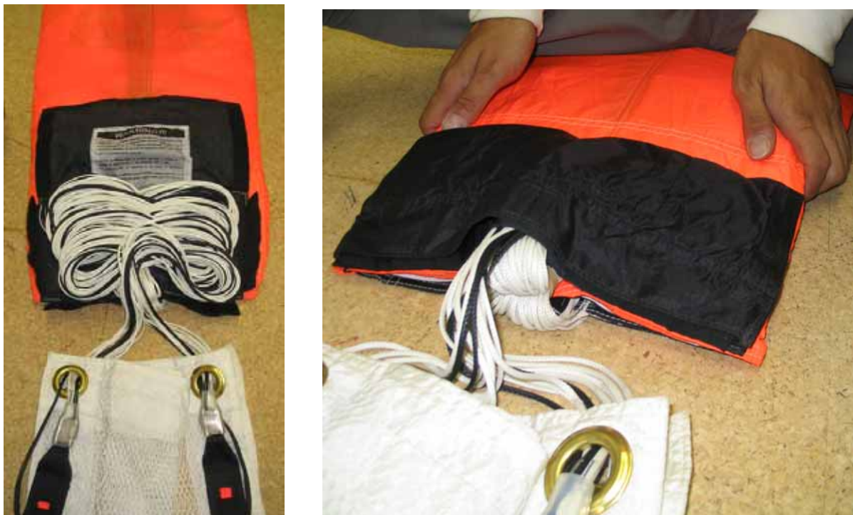
Figure 7a & 7b: S-fold lines into Tail Pocket (Slider in "down" position)

Figure 6: Once you have cocooned the canopy and made it the width of the Tail Pocket, release the tension from the container. Sit on the canopy facing the container. Open the Velcro closures on the Tail Pocket. Using the rubber band located between the Tail Pocket and the canopy, grasp approximately 6" of line below the rubber band. Place the bite of line in the rubber band and make a double stow, as shown in Figure 6a, be certain not to over wrap the lines with the rubber band. Next, tuck the primary stow between the canopy and the Tail Pocket, as shown in figure 6b.